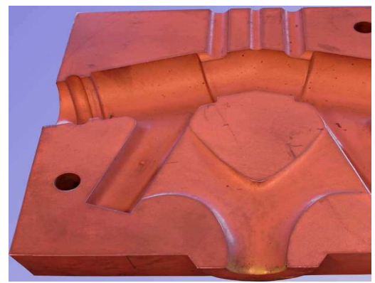
Low pressure casting mould