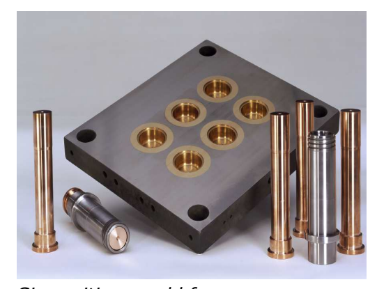
Six cavities mould for caps

HOVADUR<sup>®</sup> K alloys provide an up to ten fold increase in thermal conductivity against other mould materials. This ensures the customer shorter work cycles, higher quality, and longer lasting moulds. Each alloy is certified for the manufacture of pressing tools in the field of the production of foodstuffs and medicinal pills.