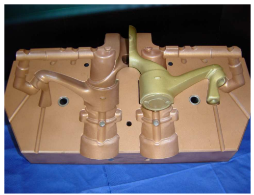
Gravity casting mould

HOVADUR® CuCoNiBe eh, CuNiBe spezial, CuNiSiCr, alloys are indispensable in foundry production due to their excellent thermal conductivity. SCHMELZMETALL's advanced manufacturing process provides greater resistance to fire cracking in all of its alloys and it allows for the most efficient cooling cycles available.