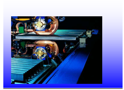
Roll seam welding

The excellent electrical conductivity of the alloys HOVADUR® CuCoNiBe eh, CuNiBe spezial, CuCrZr, CuBe2 combined with the specific alloy's maximum hardness produces optimal welding conditions and high resistance to wear. Due to our processes our alloys are applied in a wide range of resistance welding techniques such as seam, spot and cross-wire welding.